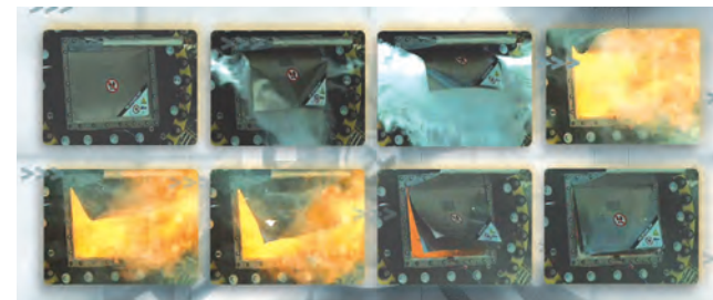
Vent re-closing sequence