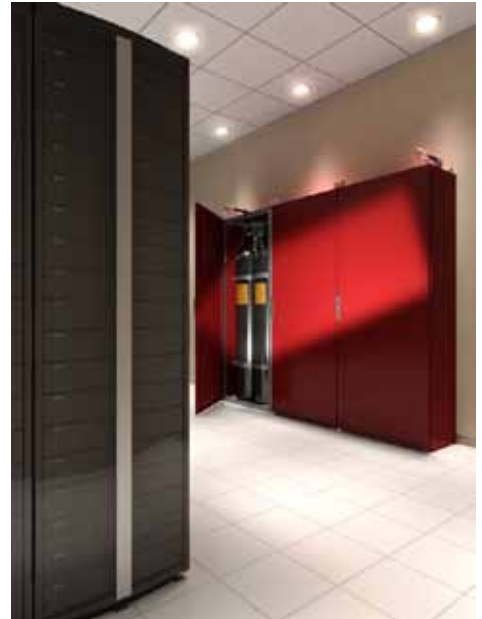
PATENT 7,686,093 - DUAL EXTINGUISHMENT FIRE SUPPRESSION SYSTEM USING HIGH VELOCITY LOW PRESSURE EMITTERS. FOREIGN PATENTS ALSO APPLIED FOR AND GRANTED.

The Victaulic Vortex 500 Fire Suppression System allows for adjustments to aim the emitter only, it is not permissible to customize or alter after point of sale. Application in a room volume or elevation above sea level different than that specified during purchase is not condoned. Please contact Victaulic for more details on these guidelines.