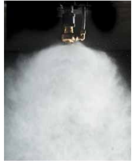
PATENT 7,686,093 - DUAL EXTINGUISHMENT FIRE SUPPRESSION SYSTEM USING HIGH VELOCITY LOW PRESSURE EMITTERS. FOREIGN PATENTS ALSO APPLIED FOR AND GRANTED.

Using proprietary supersonic technology, the system atomizes the water to <math><10\mu\text{m}</math> forming a dense homogeneous suspension of nitrogen and water. In this manner two extinguishment mechanisms are occurring simultaneously: cooling and oxygen reduction.