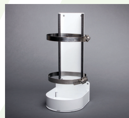
Powder coated cold rolled steel shelf bracket system