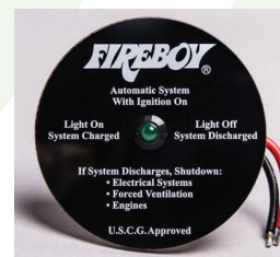
Status indicator light